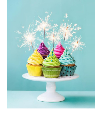
Happy Birthday Beverly Cooper (7/21) Ellie Tunis (7/21)