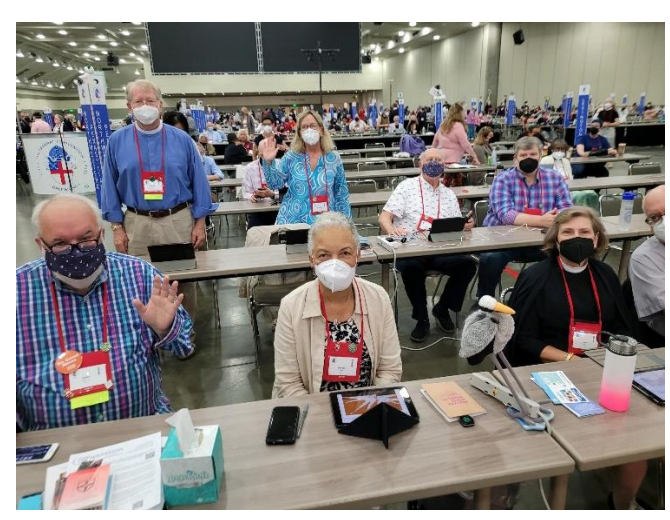
Bishop Curry's Sermon