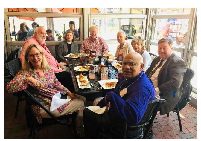
Easton Deputation Post Convention Meal

There were many other actions, testimonies, discussions, reports, committee meetings and business conducted at the convention but they are too numerous to mention in this brief report.