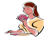
St. Clare's Fall Card Party