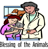
Blessing of the Animals